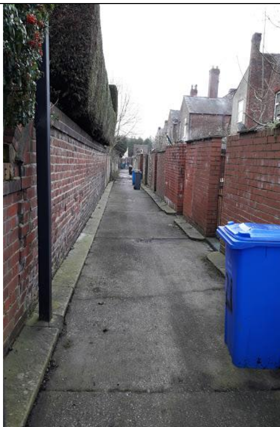
Havers (Zone 1)