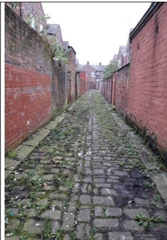
Carberry (Zone 1)