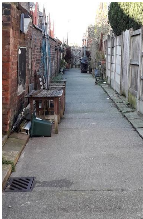
Greenfold (Zone 3)