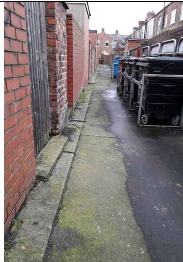
Hobart (Zone 1)