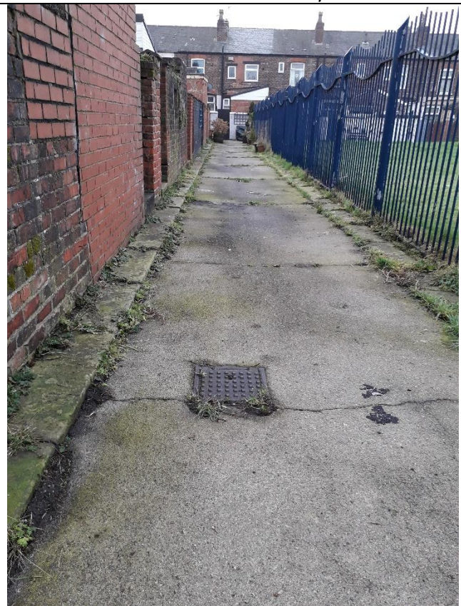
Acheson (Zone 1)

INSPECTION DATE: 05 and 06 February 2020