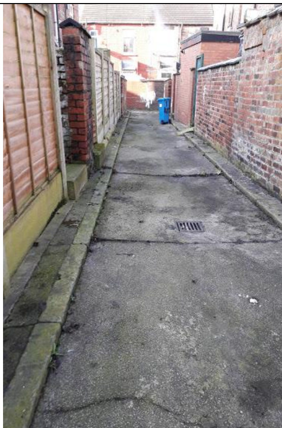
Freshwater (Zone 2)