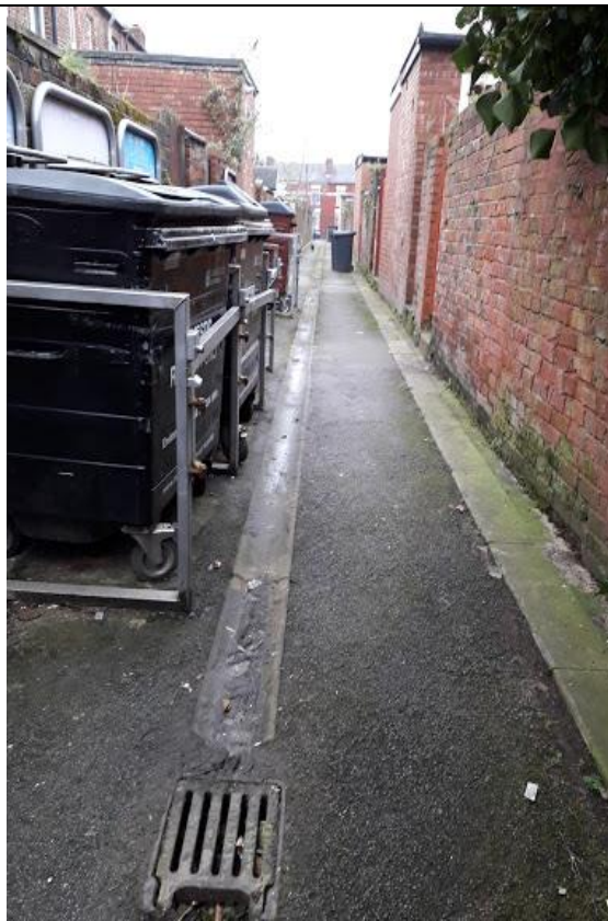
Azalea (Zone 1)