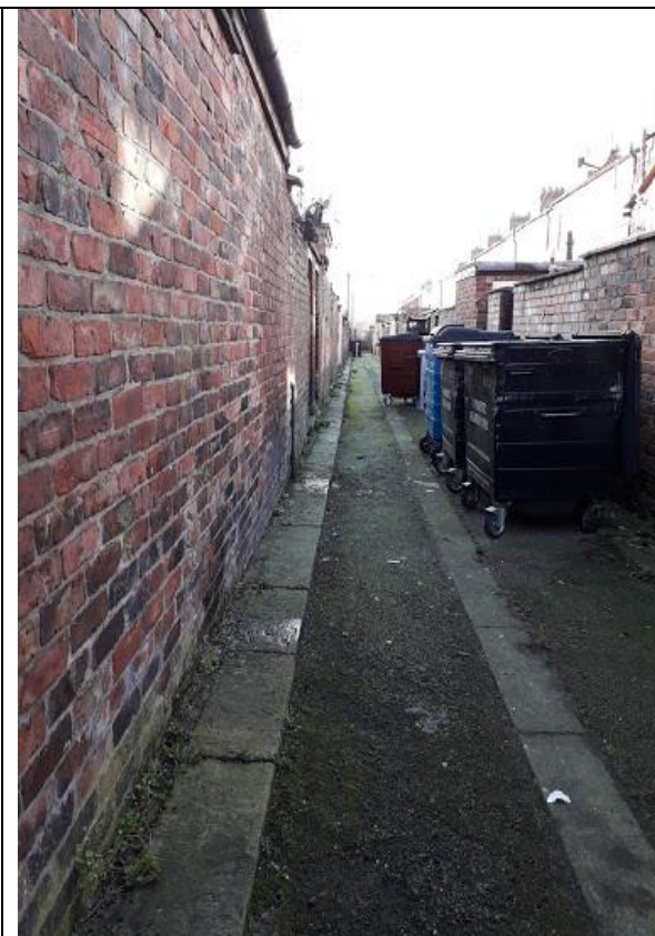
Sandown (Zone 3)