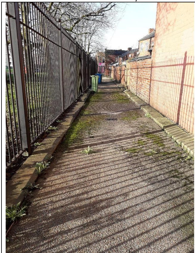
Bread (Zone 2)

INSPECTION DATE: 05 and 06 February 2020