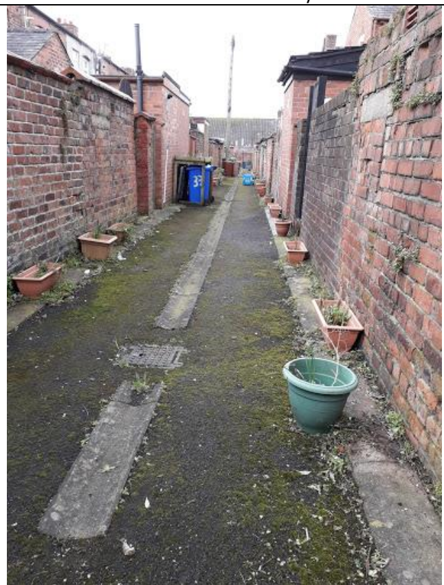
Jessop (Zone 1)

INSPECTION DATE: 05 and 06 February 2020